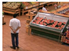
2nd Streaming VGA video of a cropped area