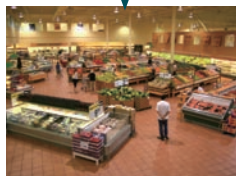
1st Streaming VGA video of a whole